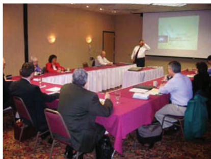
Rural Advisory Committee Meeting

January 18, 2007, was a bitter cold day, even for Austin, TX. The city was just thawing out as prospective members of the Texas Dispute Resolution System™ Rural Advisory Committee met to discuss the voids