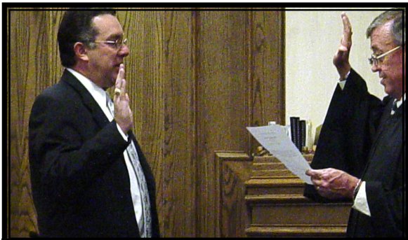
JUDGE WILLIAM P. SMITH (L) AND JUDGE MACKAY HANDCOCK (R) AT JUDGE SMITH'S SWEARING IN, JUNE 2006.

Two years later, Judge Smith still supports Alternative Dispute Resolution: “I continue to be a firm believer in ADR. I order parties to mediation in every case where a jury has been requested. I don’t think it is appropriate to pull citizens away from their daily lives to impost a result in a case when the parties haven’t even tried to resolve it themselves.”